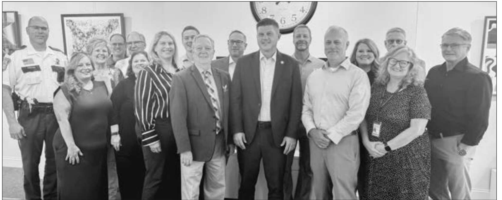
LOCAL LEADERS - Representative Brad Finstad stopped in Waseca this past week to meet with local leaders as part of his journey to visit every county in his district.

"Be kind, don't judge, and have respect for others. If we can all do this, the world would be a better place. The point is to teach this to the next generation."—Jasmine Guinness.