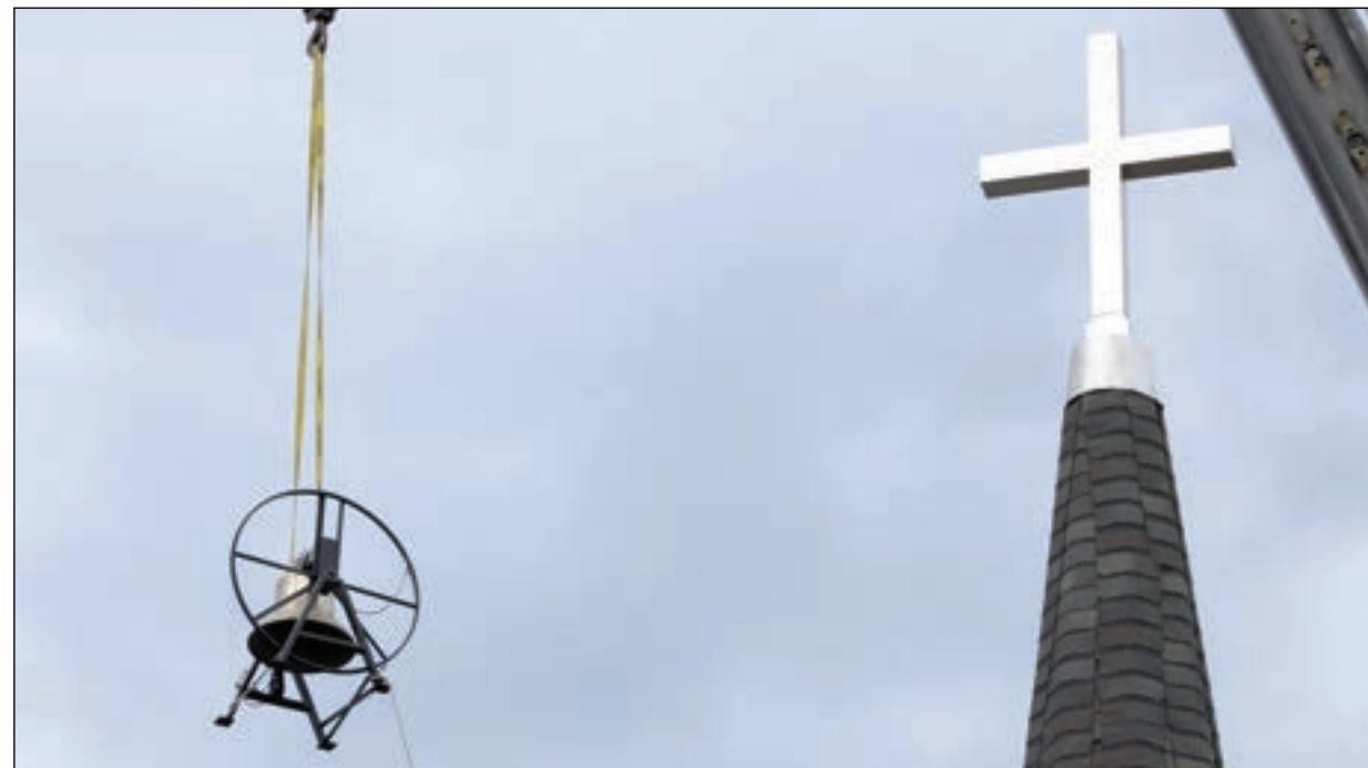
SOARING HIGH - The replacement steeple and bell for the LeSueur River Lutheran Church were lifted atop the church's bell tower on the morning of Thursday, Aug. 14.