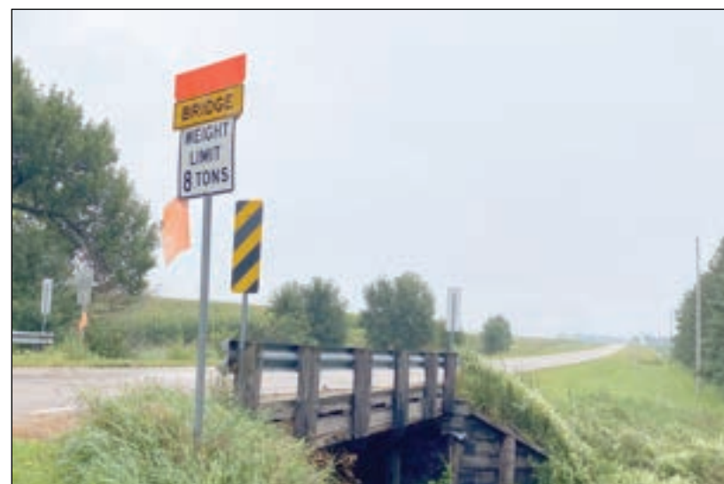
This bridge along County Road 6 northeast of New Richland was built in 1940. Stress tests showed it is no longer safe for vehicles over eight tons. Originally scheduled for replacement in 2027, it will now be replaced in the next few months.