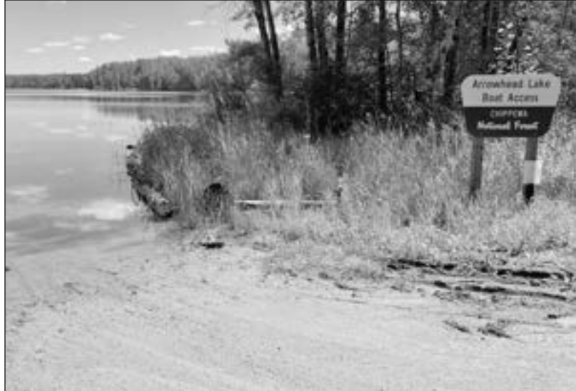
CRYSTAL CLEAR - Here are two pictures of a little lake that sits back in the Chippewa National Forest. It is one lake that we often visit when we are at the cabin. The picture shows just how clear the lakes are in this area and there are no cabins on the lake.

spring. At an estimated 64,000 in spring 2025, this is the lowest blue-winged teal population since the survey started in 1968.