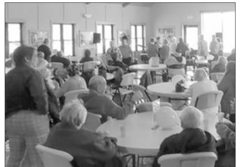
The annual Polka Party at Edgewater Bay Pavilion brings together community for an afternoon of music, fun, and connection.

Oak Park Place, St. Johns Lutheran Community, Thorncrest Senior Living and Bonnerup Fu-