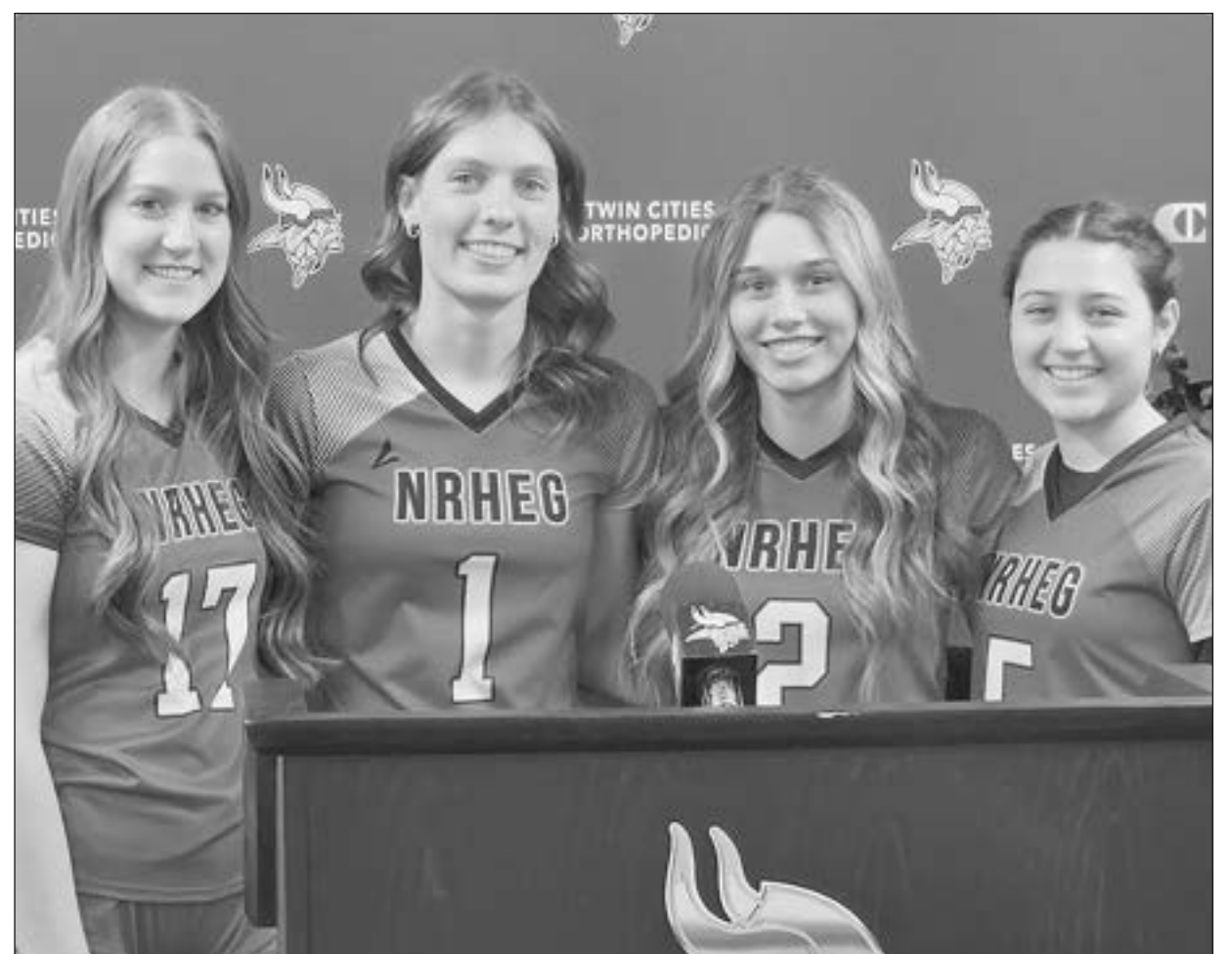
The Minnesota Vikings hosted a Media Day for all 104 high school girls' flag football programs in Minnesota this year on Monday, April 13, 2026. NRHEG Public Schools posted the event on Facebook saying, "NRHEG will have a varsity and a JV team competing this spring! We were able to bring four players to the event today."