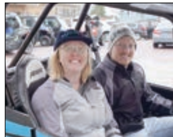
Hartland Poker Run

No. 16 Vol. CXL $2 Office in New Richland, Minnesota 56072 Thursday, April 16, 2026